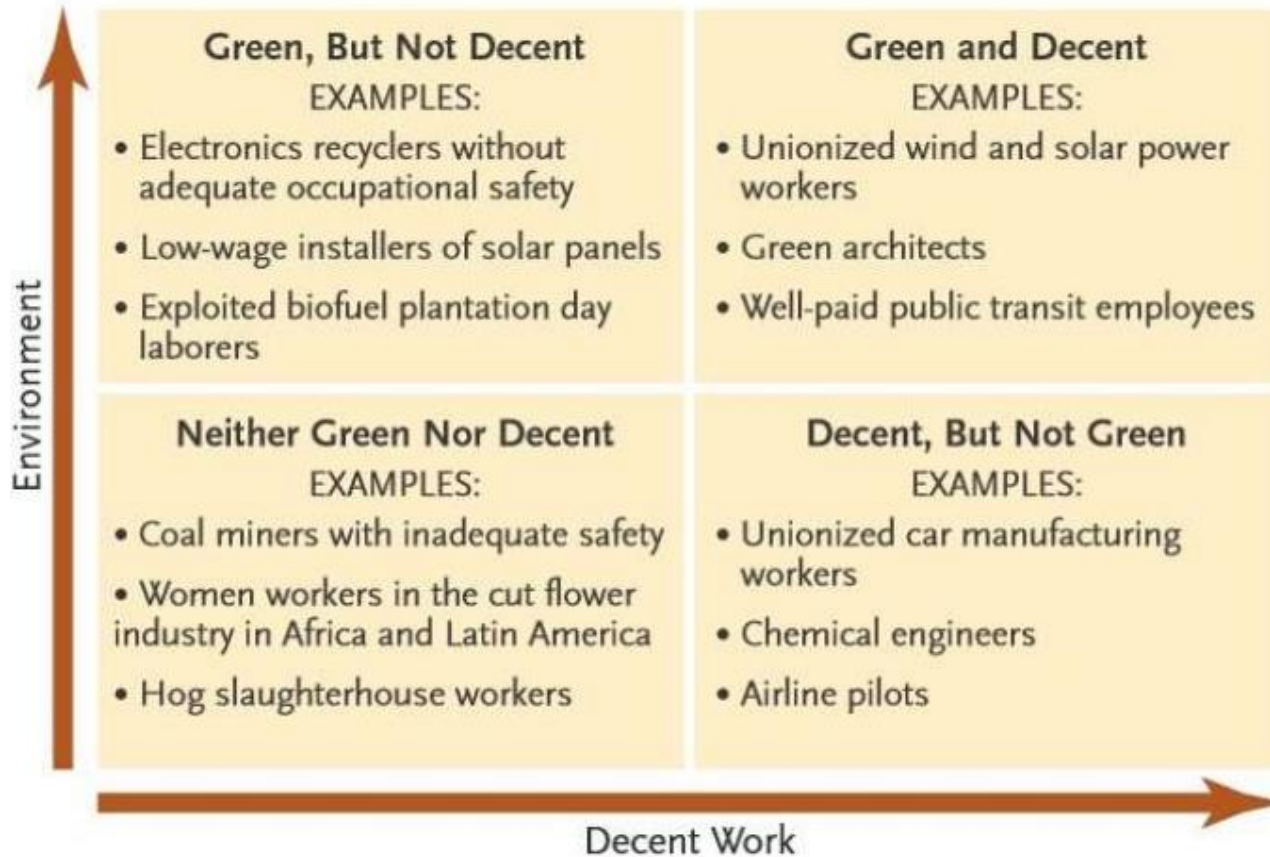
Figure 1. Green and Decent Jobs? A Schematic Overview