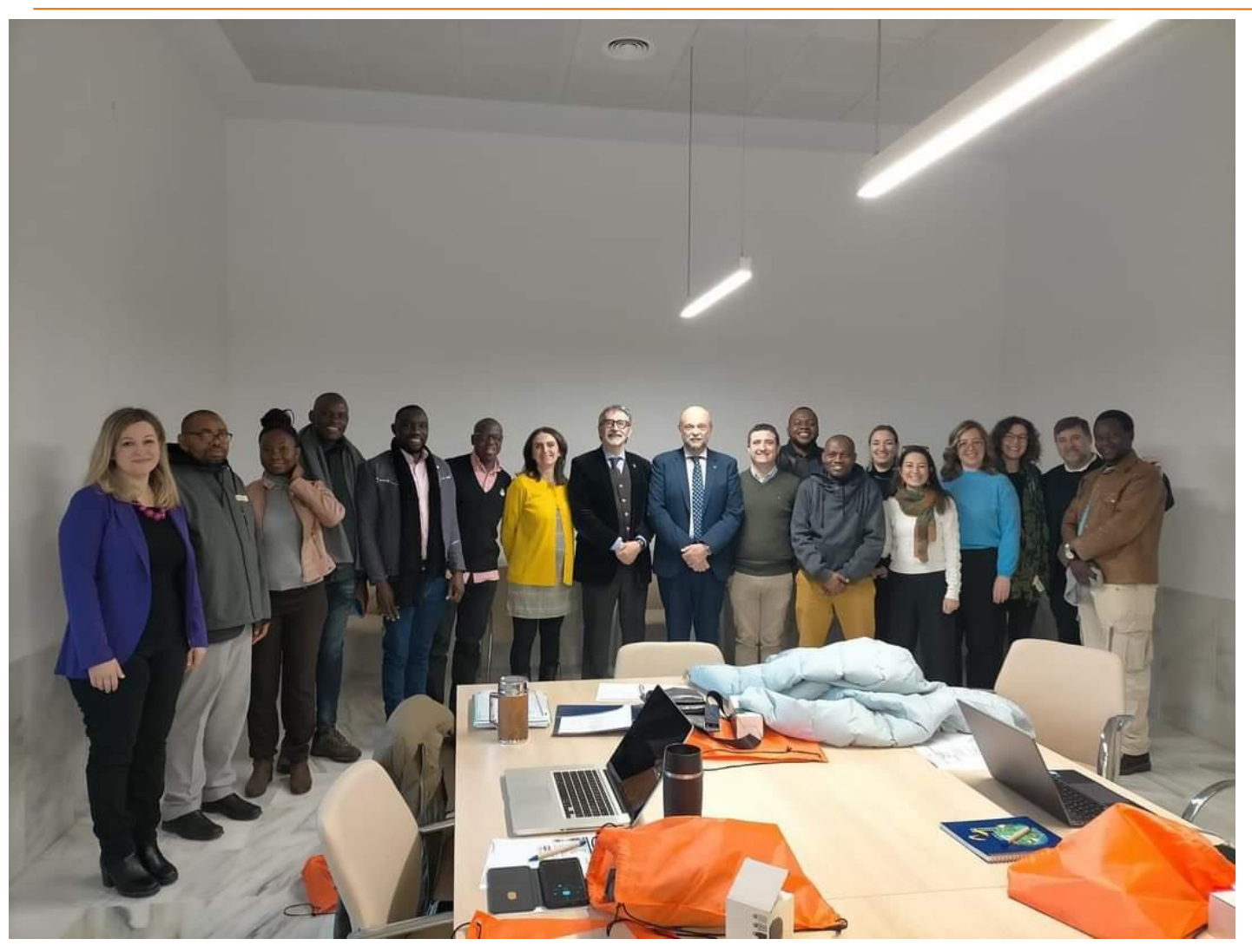
DALILA - Development of new Academic curricuLa on sustalnabLe energies and green economy in Africa Project Reference Number 609853-EPP-1-2019-1-IT-EPPKA2-CBHE-JP